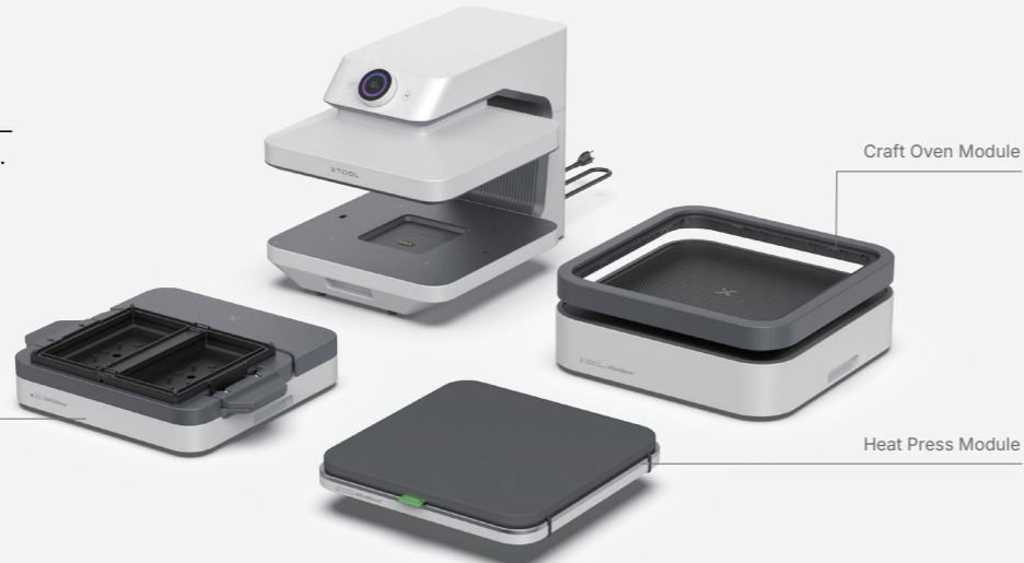
Craft Oven Module